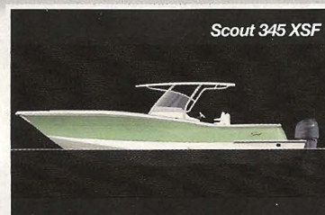
Scout 345 XSF

protected water. The new 191 is remarkable for its 10-inch draft and the fact that it planes in three seconds on a 90-horsepower engine, topping out at 34 knots.