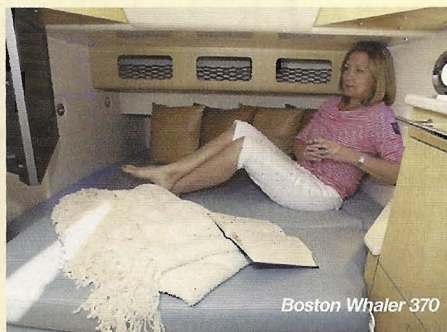
Boston Whaler 370