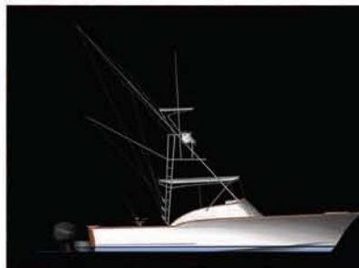
JARRETT BAY BOATWORKS PRESENTS A NEW 32' EXPRESS WALK-AROUND SPORTFISHERMAN

This latest design from Jarrett Bay is intended to be their version of an "entry-level" sportfisherman.