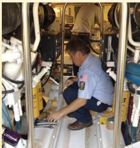
Gregory Poole Cat technicians hard at work on Magic Moment

of Wednesday June 11th. Gregory Poole Caterpillar had their service team poised to help and worked around the clock to help get them back out fishing.