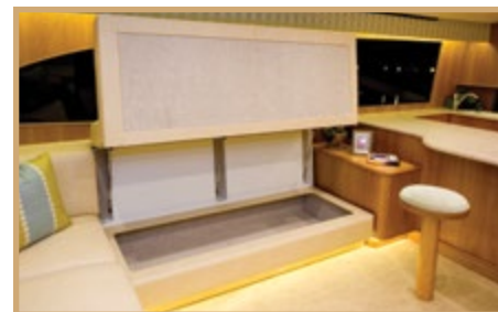
The one-piece hydraulic sofa lift allows for easy storage access without any fussing with cushions