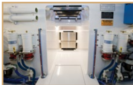
Sub-zero freezers under the cockpit are accessed by folding up the engine room ladder